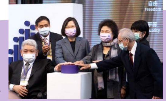
Taiwan President Tsai Ing-wen (third left), CY president Chen Chu (third right) and NHRC member Wang Jung-Chang (left) adopt new human rights logo; Dec. 10, 2020

The design of the National Human Rights Commission's logo is inspired by the five major ethnic groups of Taiwan. The main color is purple, signifying awareness of suffering. The sign also represents Taiwan's steadfast pursuit of the five values of equality, freedom, diversity, justice and democracy.