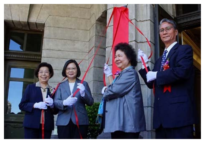
NHRC sign unveiling; Aug. 1, 2020

Taiwan's vice president Lai Ching-te presided over the inauguration of the sixth president of the Control Yuan (CY) and 26 new CY members, at a handover ceremony on August 1. Incoming CY president Chen Chu said the CY would work on being more in line with the spirit of modern democracy and in step with the times. Chen said she also would perfect the powers and mechanisms of the National Human Rights Commission (NHRC).