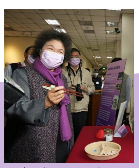
Chen Chu uses assistive devices; Dec. 4, 2020

National Human Rights Commission (NHRC) chair Chen Chu and other Control Yuan (CY) members called on the National Academy for Educational Research on November 23 to discuss human rights education with deputy education minister Tsai Ching-Hwa. They reached agreement on spreading human rights awareness and developing human-rights enabling environments in the process of training school teachers, directors and principals.