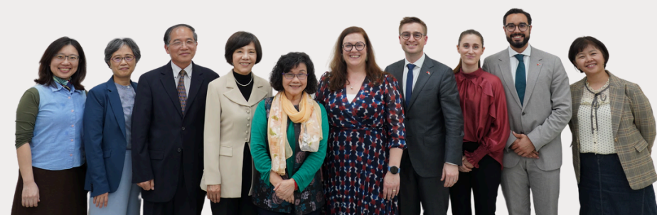
Group photo of NHRC representatives and the Luxembourg Chamber of Deputies delegation (8 April 2025)