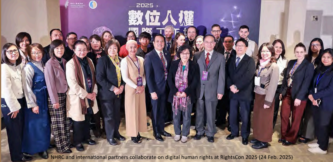
NHRC and international partners collaborate on digital human rights at RightsCon 2025 (24 Feb. 2025)