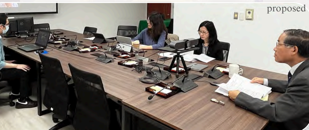
CY has actively participated in IOI activities to fulfill its membership obligations.

meeting was held on May 12, 2025 in Rabat, Morocco, in a hybrid format. The CY remains committed to contributing actively to the Committee and advancing the IOI mission. 🇹🇼