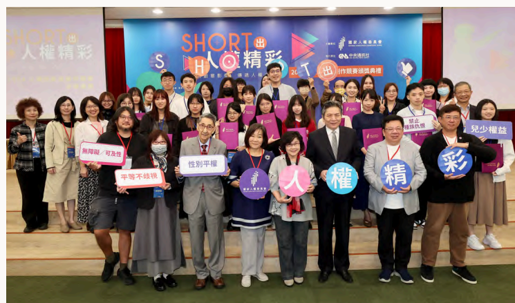
Group photo of the award winners with their families, judges, and distinguished guests (25 May 2025)

Furthermore, People's Choice Awards were selected through online voting. The award went to a film illustrating the daily school life of autistic students in the student category. In the general category, the winner explored the revival of indigenous clothing traditions by contrasting generational perspectives. 三