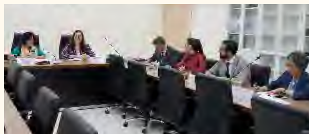
Luxembourg parliamentarians engage with NHRC on Human Rights during their visit

urged the government to uphold migrant workers' rights in accordance with international human rights standards.