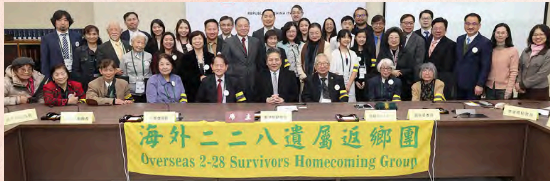
CY members recognize the Group for their longstanding support of Taiwan’s democracy (24 Feb. 2025)