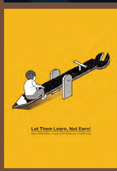
Selected award-winning posters ▲