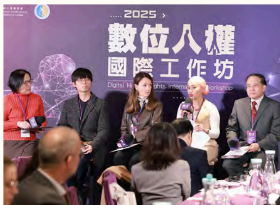
Philippine CHR Commissioner Dumarpa (2nd right) shares insights on digital threats faced by human rights defenders

For the first time, RightsCon, the global digital human rights conference, was held in Taiwan. On February 24, 2025, the National Human Rights Commission (NHRC) and the Philippine Commission on Human Rights (CHR) co-hosted the “2025 Digital Human Rights International Workshop” to explore digital rights and policy strategies.