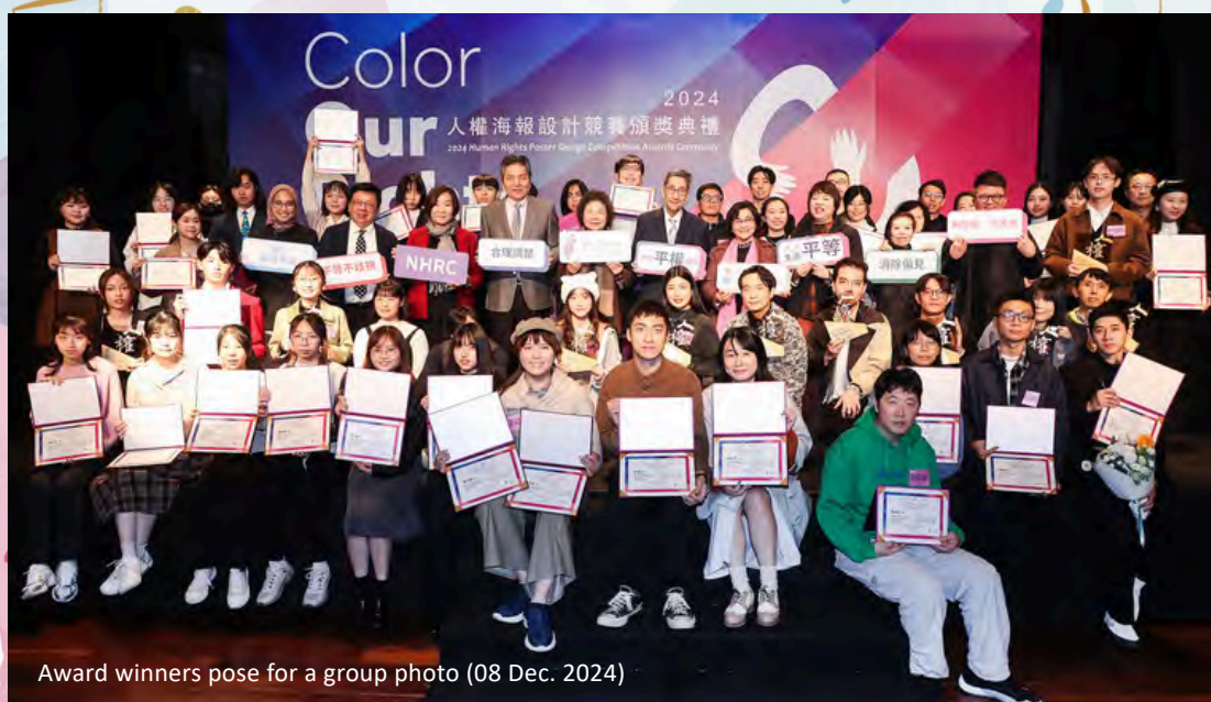
Award winners pose for a group photo (08 Dec. 2024)