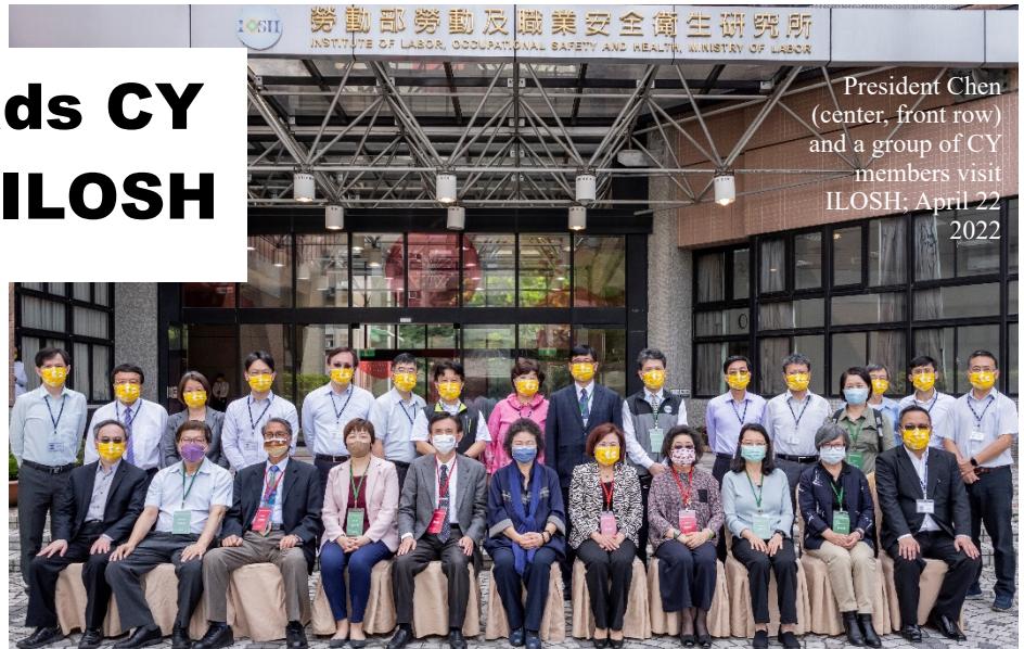
President Chen (center, front row) and a group of CY members visit ILOSH; April 22, 2022

CMTE. ON SOCIAL WELFARE AND ENVIRONMENT HYGIENE AFFAIRS CONCERNS FOR THE RIGHTS OF WORKERS