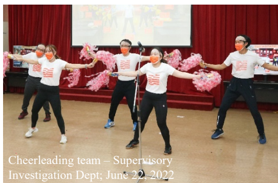
Cheerleading team – Supervisory Investigation Dept; June 22, 2022

To strengthen the professional knowledge of new recruits and give senior staff a training in new information, the CY organized a buzzer game to encourage employees to gain a deeper understanding of the CY's functions, powers, and work on June 22. Before a concluding quiz, each department prepared a chant and a cheerleading routine to encourage their competing colleagues. The performances opened the competition.