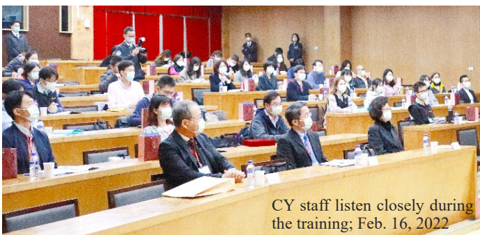
CY staff listen closely during the training; Feb. 16, 2022

On February 16, 2022, the Control Yuan (CY) partnered with the Ministry of Justice Investigation Bureau (MJIB) to conduct a series of classes and working observations on the topic of science and technology in criminal investigations.