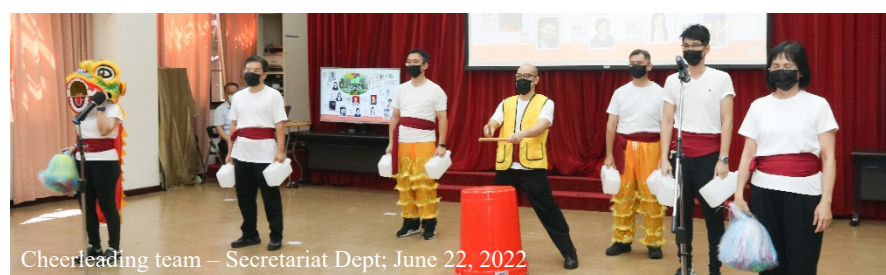
Cheerleading team – Secretariat Dept; June 22, 2022