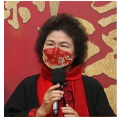
CY President Chen Chu wishes staff happy Lunar New Year at 2022 spring group greetings; Feb. 7, 2022

CHEN THANKED EVERYONE FOR THEIR COLLECTIVE EFFORTS OVER THE PAST YEAR