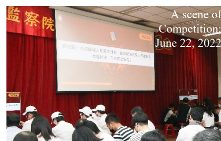
A scene of Competition; June 22, 2022