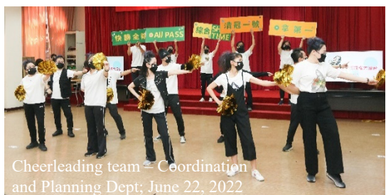
Cheerleading team – Coordination and Planning Dept; June 22, 2022