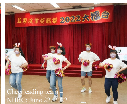
Cheerleading team – NHRC; June 22, 2022