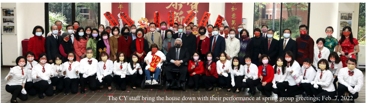
The CY staff bring the house down with their performance at spring group greetings; Feb. 7, 2022