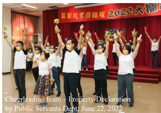
Cheerleading team – Property Declaration by Public Servants Dept; June 22, 2022