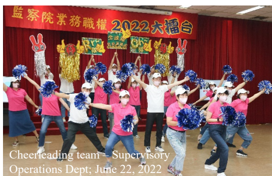
Cheerleading team – Supervisory Operations Dept; June 22, 2022