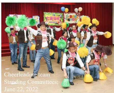
Cheerleading team – Standing Committees; June 22, 2022