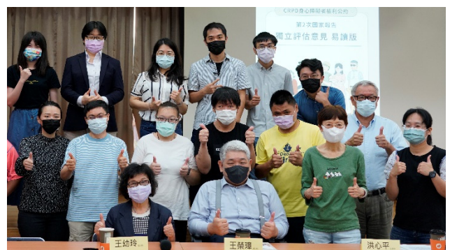
Group photo of production team members; June 1, 2022

The NHRC enlisted the League For Persons With Disabilities to convert the report of over 53,000 words into conversational language. An illustrator will draw nearly 100 pictures for explanations. By the end of July, 2022, a printed booklet, an electronic version of the report will be posted on the NHRC website.