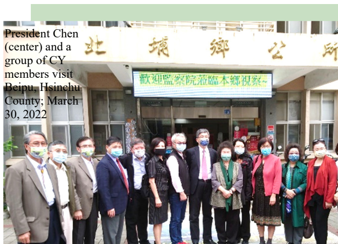
President Chen (center) and a group of CY members visit Beipu, Hsinchu County; March 30, 2022

Within the context of the COVID-19 pandemic, CY President Chen Chu was especially concerned for the occupational safety and rights of workers. Committee inspectors asked other questions about youth occupational safety research, drafting of the Labor Education Promotion Act, the impact of the pandemic on the labor market, labor shortage problems, occupational accident prevention, and the new labor pension system. The Labor Minister and the ILOSH Chairperson gave concise explanations and responses to the questions.